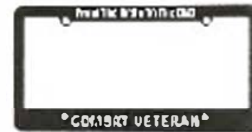
License Plate Frame $10 ea plus $6 shipping