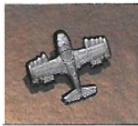
A-37 Lapel Pin 1" sq $8 (includes shipping)