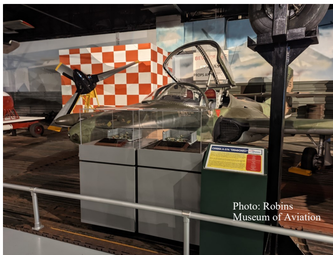
A-37A #14525 on display at Robins Museum of Aviation. Note dioramas now placed in front of the aircraft.