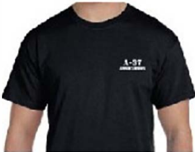
Dragon T-shirt $21 (includes shipping) (XL)