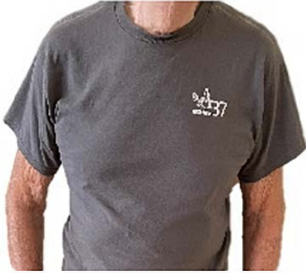
(New) 2022 T-shirt $21 (includes shipping (S, M, L, XL, XXL)