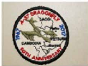
50th Anniversary Patch $6 (includes shipping)