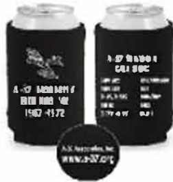
Koozie $2 (includes shipping)