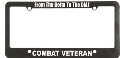
License Plate Frame $10 ea plus $6 shipping