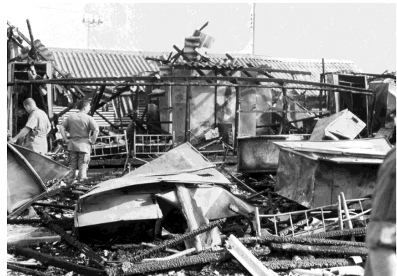
Building struck by VC rocket in February 1968

I suffered in silence for decades. Upon military retirement, the VA diagnosed me with moderate PTSD for a 55% disability.