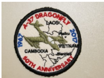
50th Anniversary Patch $6 (includes shipping)