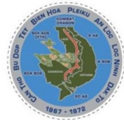
2.25-inch SEA Decal $5 (includes shipping)