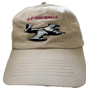
Galveston Cap $15 (includes shipping)