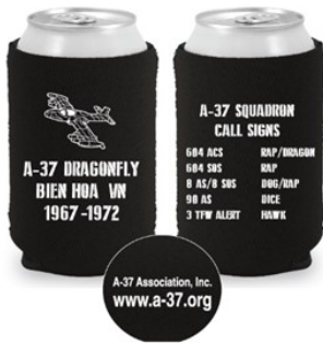
Koozie $2 (includes shipping)