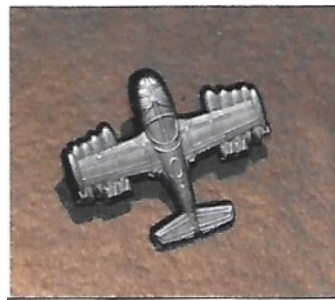
A-37 Lapel Pin 1" sq $8 (includes shipping)