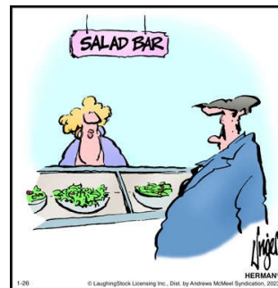
“Gimme a gin and lettuce.”

“The A-37 Association is for those who flew, worked on/with, were saved by, or have high admiration for the great little fighter.”