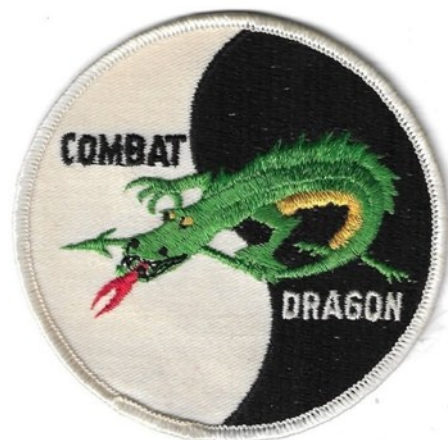
Original Combat Dragon patch, 1967.

...the smallest fighter... the fastest gun